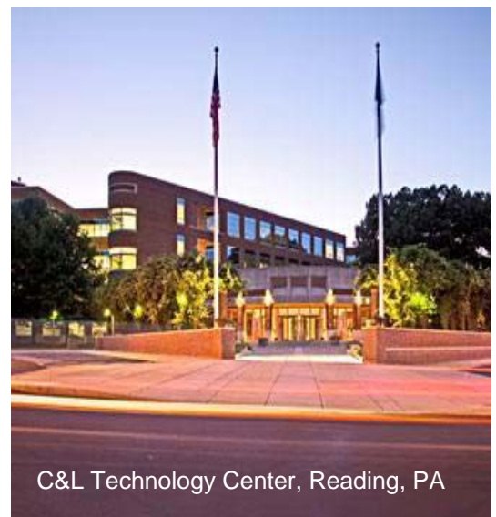
C&L Technology Center, Reading, PA

C&L Group's Quality Assurance & Testing service offers one of the most comprehensive solutions to Quality Assurance and Testing in the market today. C&L's approach combines best practices with a proven methodology that provides the right blend of process rigor and practical experience to meet your business objectives. As apart of C&L's outsourcing methodology we can support these activities at the customer location or at our Technology Center located in Reading, PA.